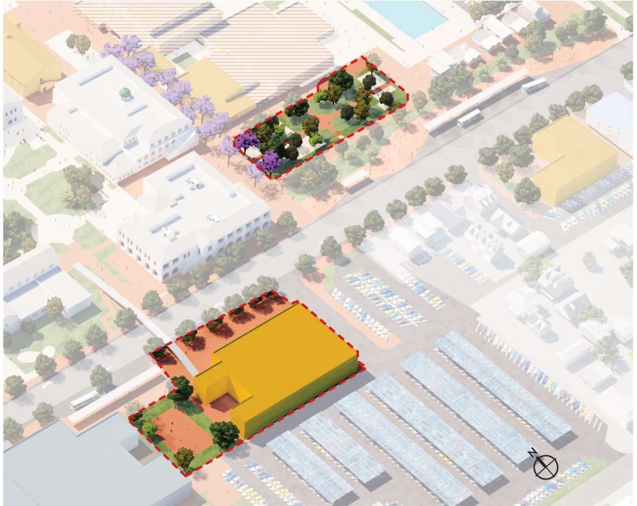
PROPOSED OPPORTUNITY SITE LOCATION AND EXTENTS

The 2000 Building is programmatically out of date and its physical condition is very poor. After the relocation of Student Services, and associated student amenities, to the new centrally located Welcome Center located at the corner of Chapman Avenue and Lemon Street, the building will be mostly vacant. The building should be demolished and a new Fine Arts building built in its place. This will give the Fine Arts program its desired adjacency to the future Performing Arts district, showcasing community and arts spaces as a vital creative part of a campus and community district. The design of the new arts district development can incorporate an outdoor plaza and garden to connect the new buildings, provide an outdoor community gathering space, and enhance the City Spine along Chapman Avenue.