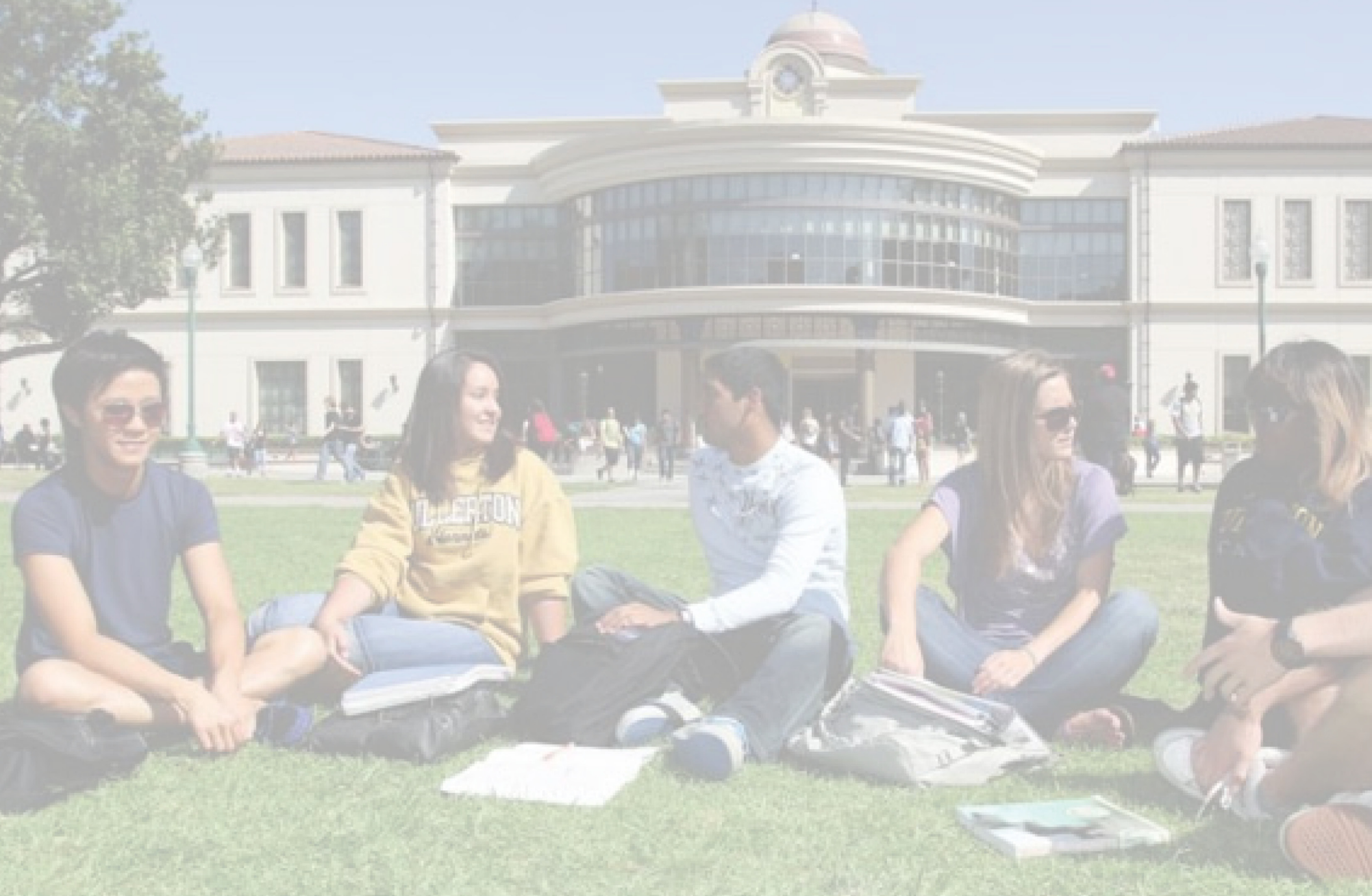
STUDENTS ON THE MAIN QUAD